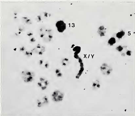
Fig. 3. Male meiosis, C-banded metaphase I

C-stained preparations did not only reveal the centromeric C-bands, but also allowed the identification of the autosomes nos. 5 and 13 and of the sex bivalent. The partly heterochromatic pair no. 5 nearly always formed a cross like bivalent with one chiasma, visible only in the euchromatic part of the long arm. This